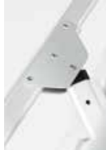
Double Reinforced Joints