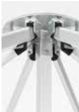
Telescoping Crank System