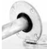
Hinged Spigot Installation